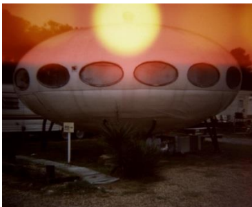
Sue Wrbican: Spaceship