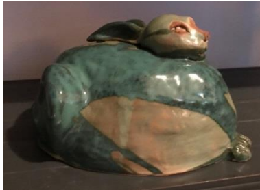
Vicki McComas: Moon